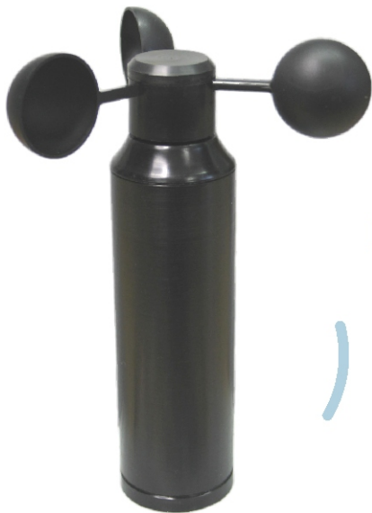
WIND SPEED SENSOR with life time lithium battery